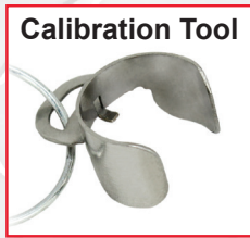
(ring not included)